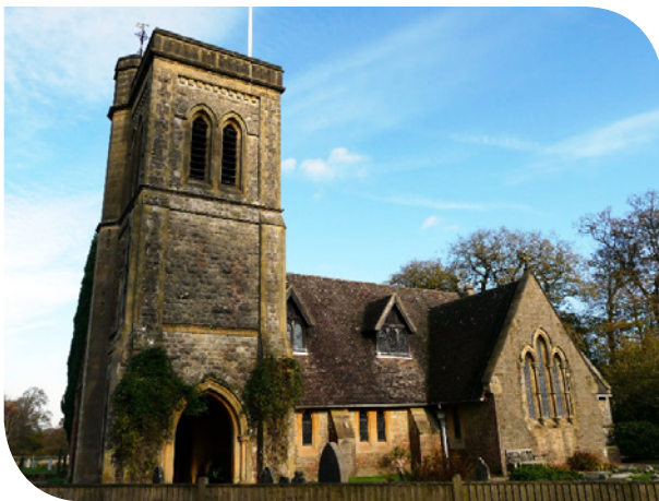
St. Lawrence Church