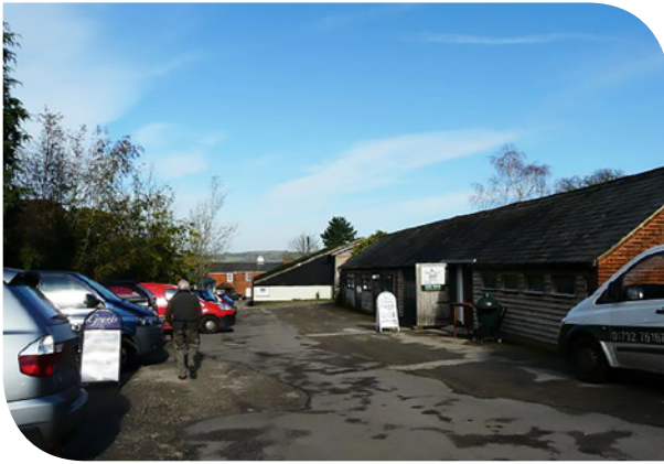
Chart Farm Businesses